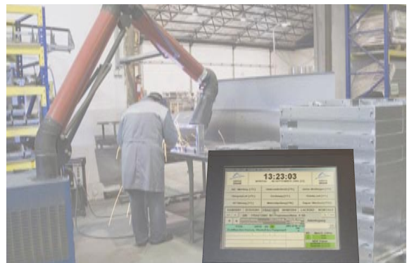
Industrial PC as PDC terminal