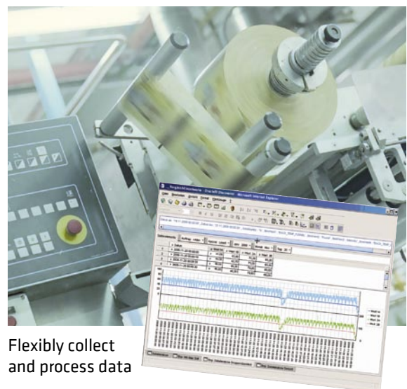
Flexibly collect and process data