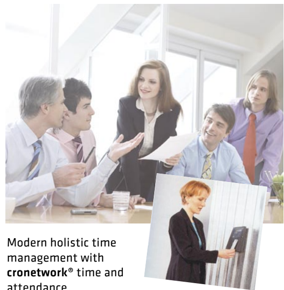
Modern holistic time management with cronetwork® time and attendance

Graphical support without the need to frequently switch masks and context-sensitive jumps to editing masks assure simple operation. All functions relevant for time management are depicted on a single calendar.